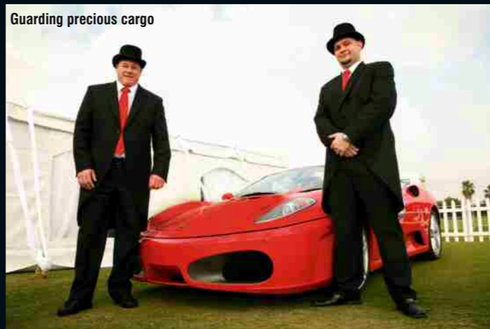
Guarding precious cargo